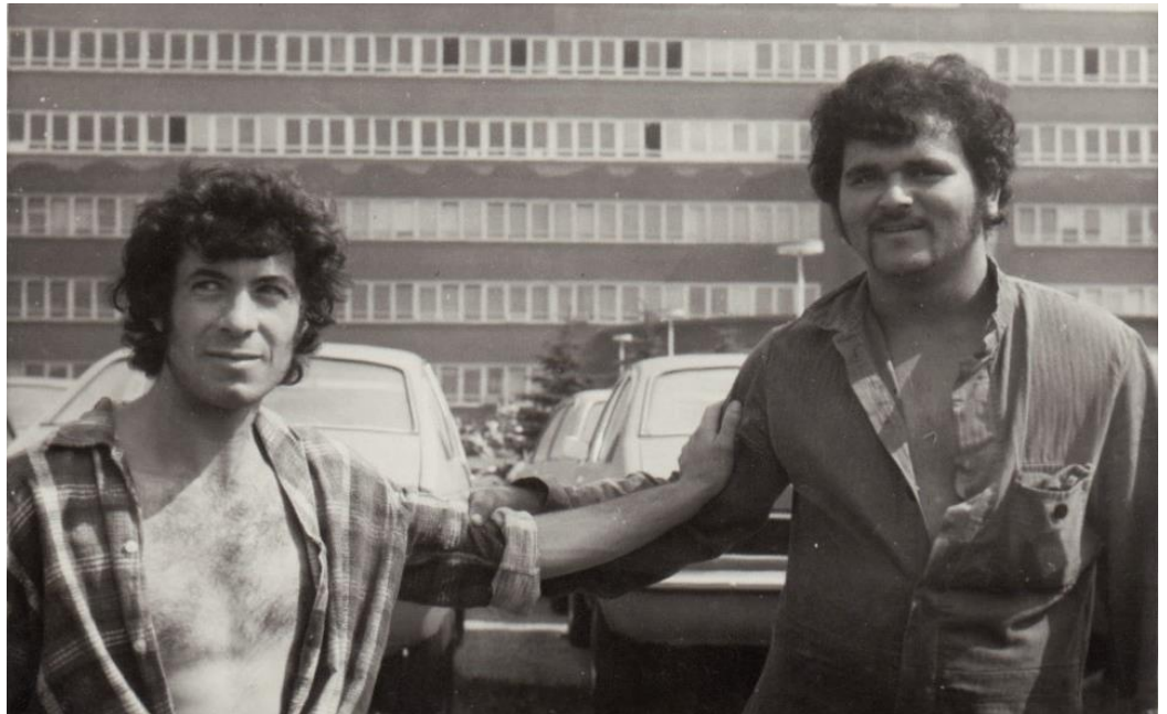
Streikende italienische Arbeiter, 1973.

Pressebilder im Downloadbereich: Hausderkunst.de/presse